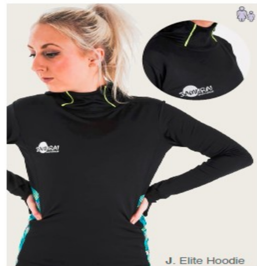
J. Elite Hoodie