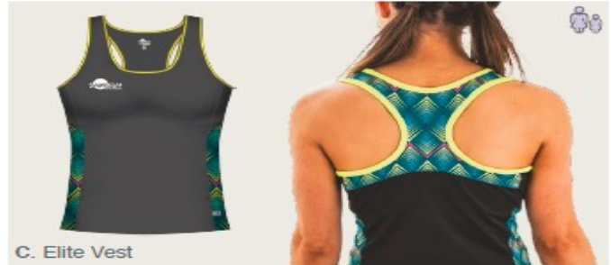
C. Elite Vest