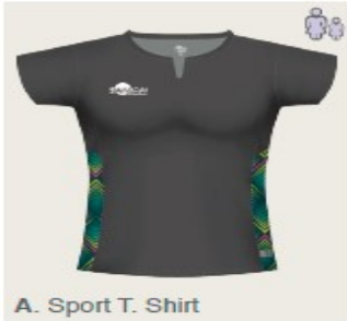
A. Sport T. Shirt

In timeless styles, our innovative designs are the building blocks for your athleisure wardrobe. Comfortable, supportive and flattering.