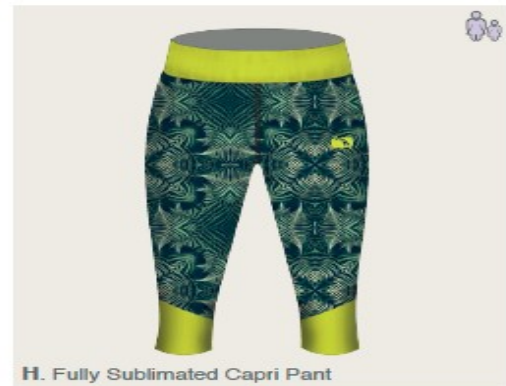
H. Fully Sublimated Capri Pant