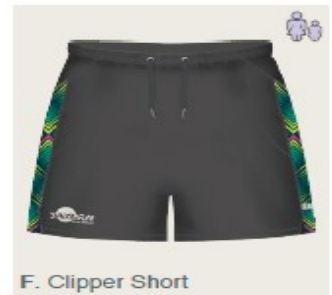
F. Clipper Short