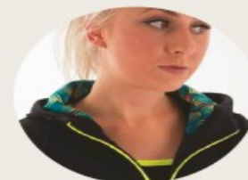
K. Full Zip Tech Hoodie

Available in many Cut & Sew designs or with sublimated panels to make it truly unique to you.