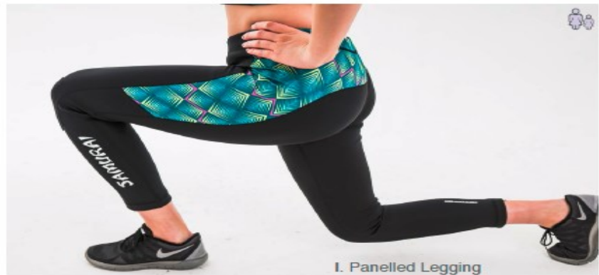
I. Panelled Legging